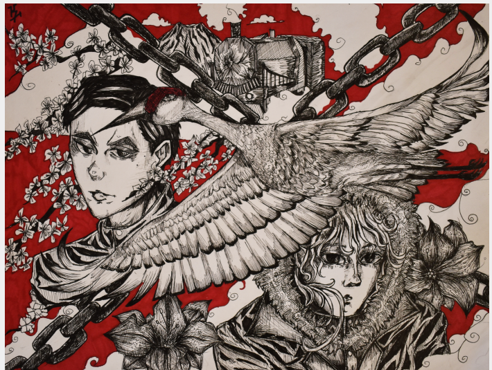
Far Away Gone - Kyut Paw