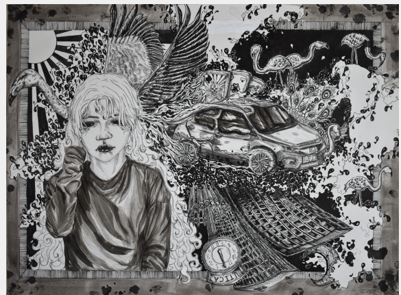
The Meaning- Kyut Paw