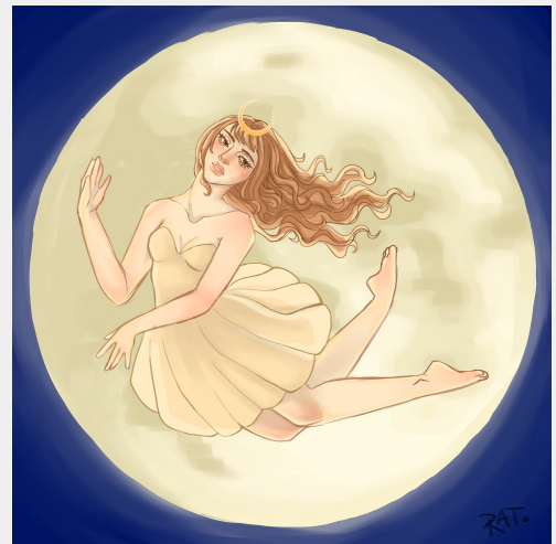
Selene Embodiment of the Moon- Navaeh Heburn