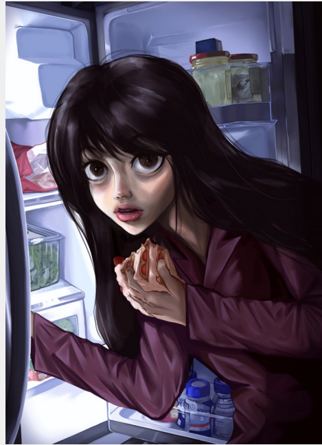
Hunger - Angelina LE